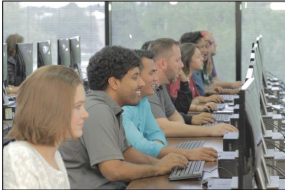
CBS students enjoy a computer class

Our students receive top-rated academics with top-rated accreditation . We are accredited through the Southern Association of Colleges and Schools Commission on Colleges (SACSCOC) and the Association of Biblical Higher Education (ABHE). CBS is one of just a few Bible colleges in the nation with this dual accreditation.