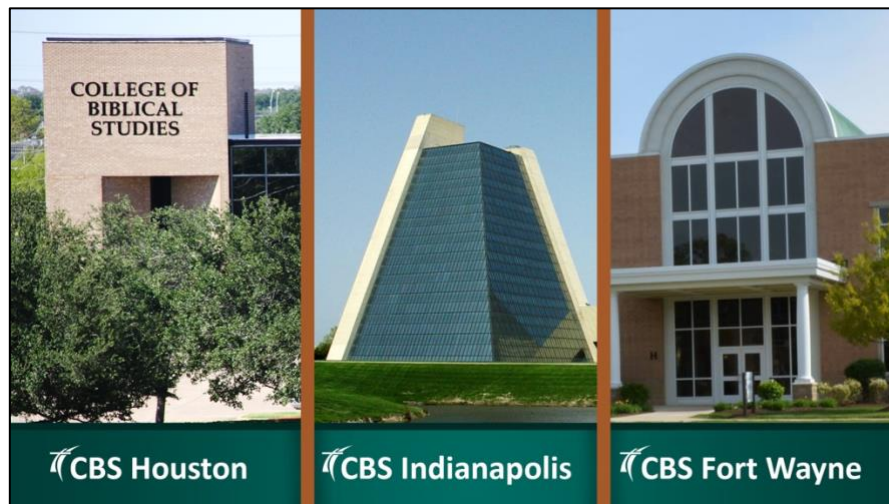
CBS offers classes online and at our three campuses