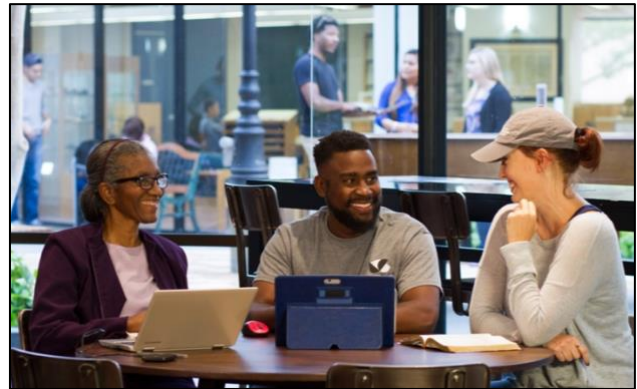
Life-long relationships are formed at CBS

But what makes our degree programs and classes so exceptional is our life-transforming curriculum. Every class is rooted and founded in the Bible. From the first class to the last, students gain a biblical worldview to address the challenges and opportunities of today's society.