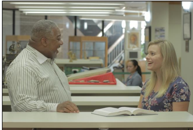
CBS students discuss class assignments and biblical theology

CBS was established to not only serve a diverse student body, but to train our students to serve this ever-changing diverse world. Students love the diversity in the classroom. They tell us there is a powerful connection made sitting and learning with classmates from 17 to 70, all ethnicities, and all socio-economic backgrounds. Life-long relationships are formed between people whose lives are worlds apart, yet they share a passion for the word of God.